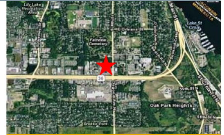
14612 60th Street Stillwater, MN

Location: 14612 60th Street, Stillwater, MN Description: Stand-Alone Retail or Office Square Feet: 1,860 Year Built: 1960 Condition: Good