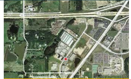
5595 Memorial Avenue Oak Park Heights, MN

Location: 5595 Memorial Avenue, Oak Park Heights, MN Description: Build-Ready Pad Square Feet: 54,450 Availability: Immediate Sale Price: $499,000 Terms: Negotiable